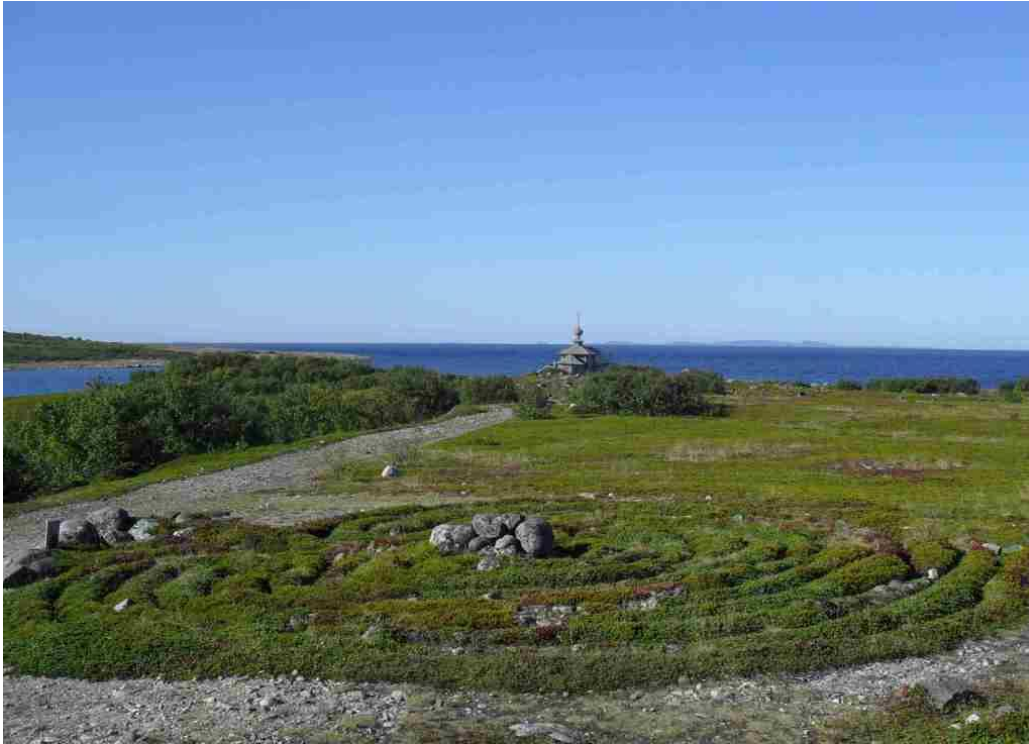
Another island of the Solovky Islands filled with these kinds of "stone circles" with a small Orthodox Church.