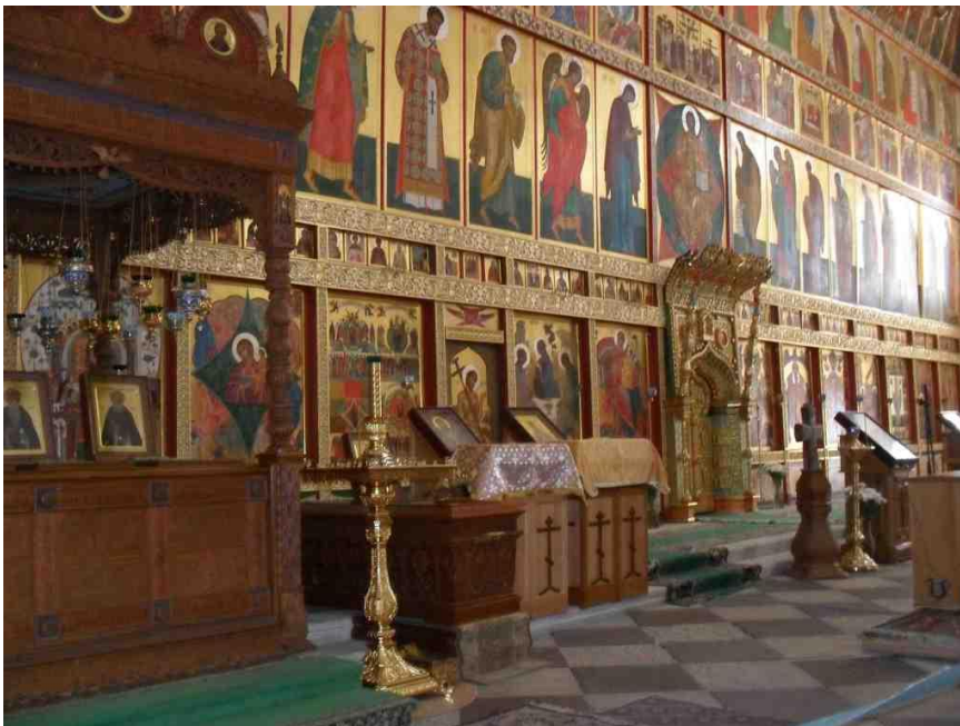
The place where we went into meditation in the monastery.

The monastery was built on one of these Light anchors. These islands were the Spiritual Lighthouse of Russia and the Baltic regions for a very long time, until the darkness came to destroy, make dirty and contaminate some of these sites. Your visit and what you have helped us to do will reactivate everything.