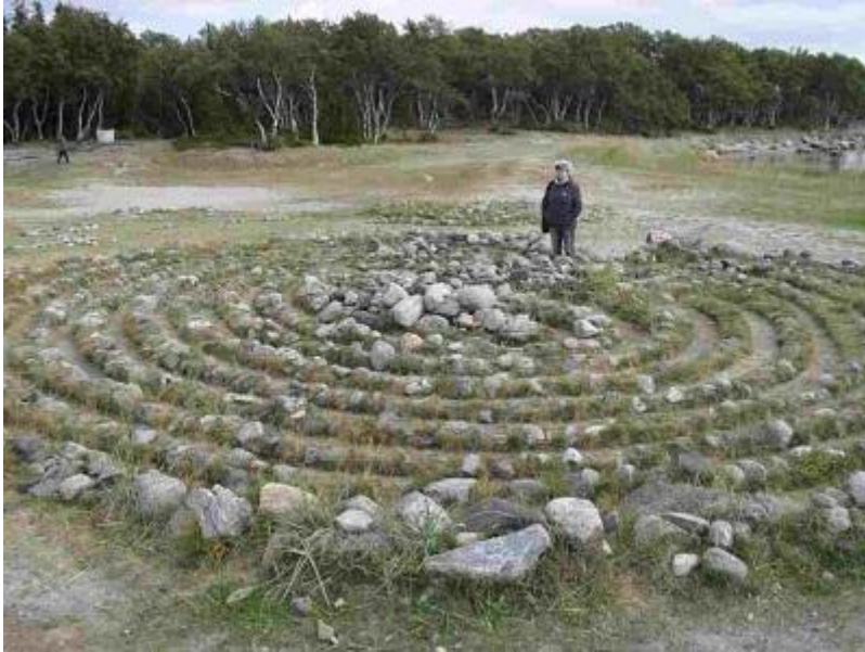
Another « stone circle ».

you well and there is always someone who speaks a bit English. Oh! What an adventure!}}