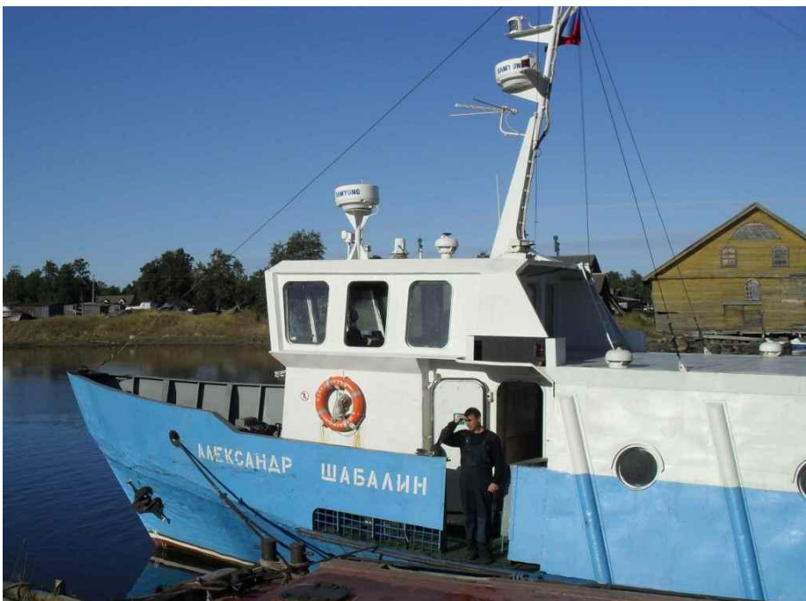
The boat we took

with a group of Russian tourists to get to this small island.