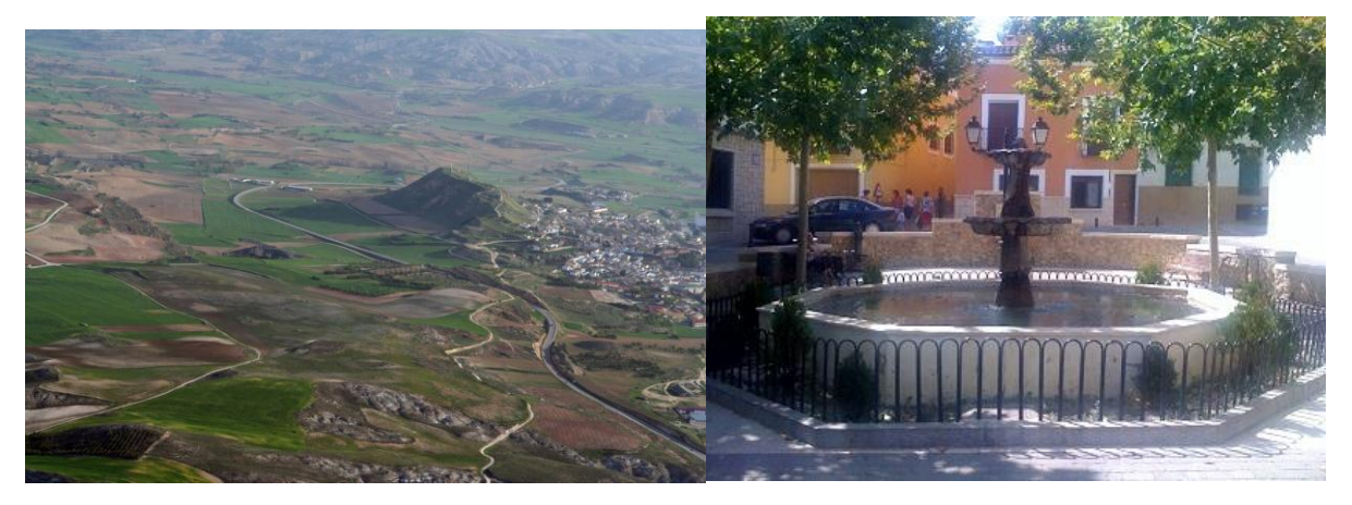
Data retrieving almost on top mountain

You can also create an anchor on the central square of the city and use it like the other ones.