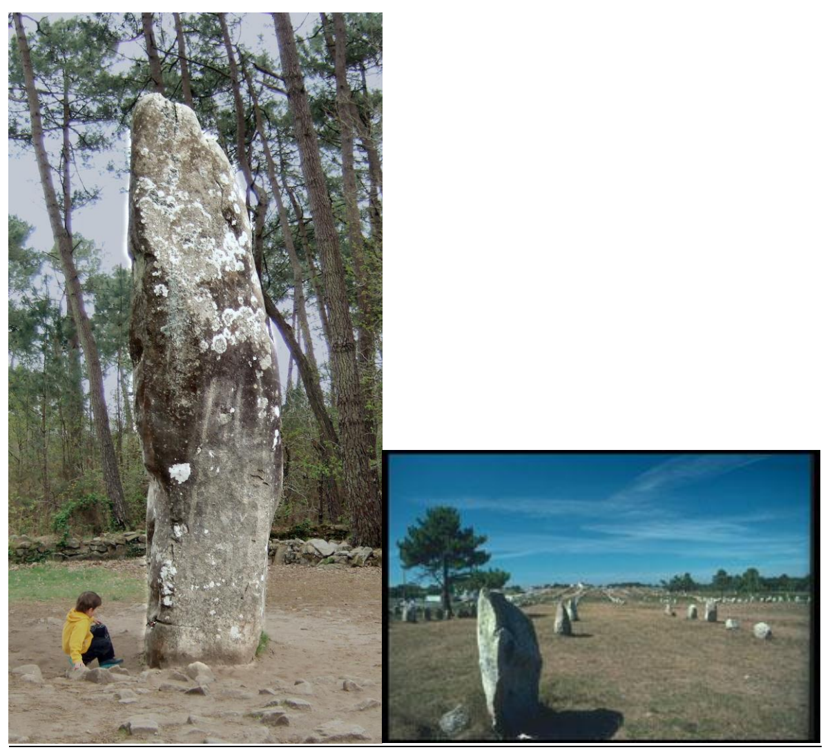
Giant Menhir Light Anchor