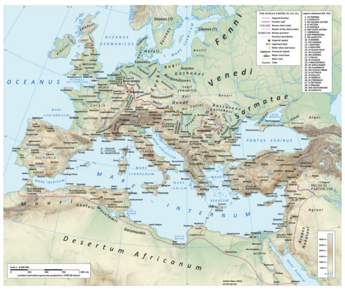
Roman map with their occupied territories.

They are not the "Teutonic Knights" or "German order" which was a spiritual order of not free people, created during the third crusade in the 12th century, 700 years ago for war purposes.}