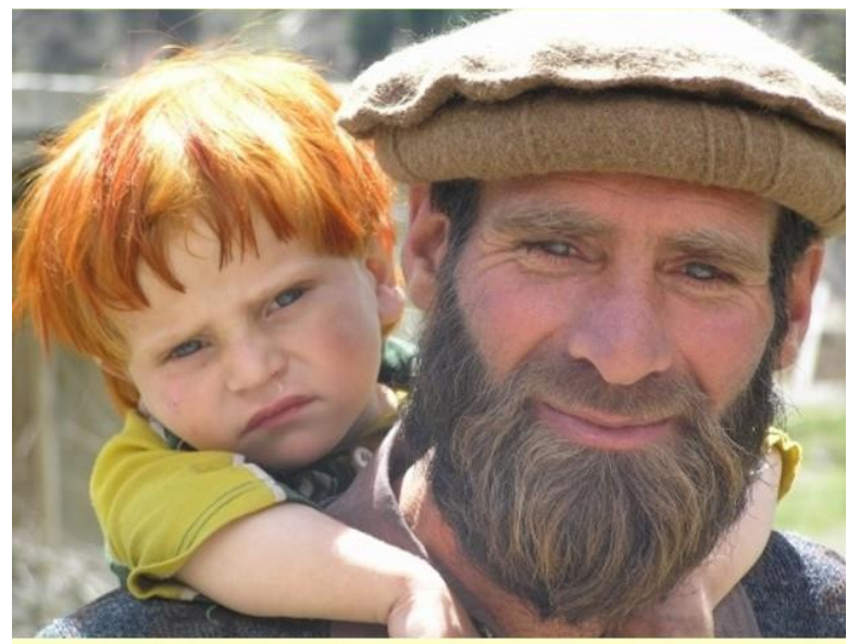
Nuristani father and son: The Nuristani are an original Albino people of the Hindu Kush mountain region of Eastern Afghanistan and the Chitral area of Pakistan.