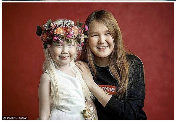
Top model Russian albino (left)