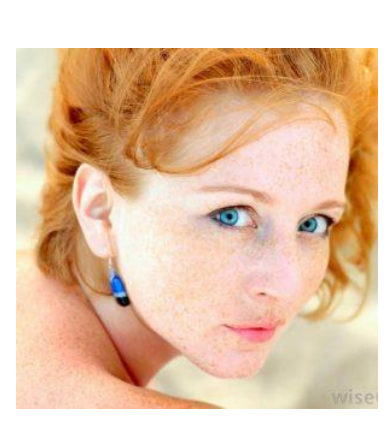
Irish Albino (left) ancient generation Irish albinos (middel, right)