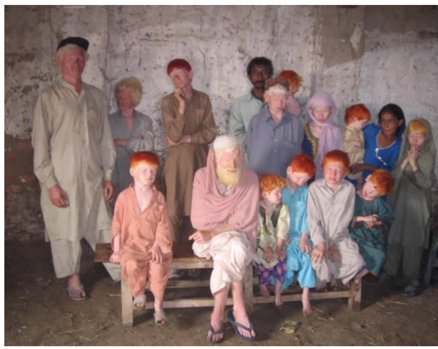
Bathi albinos from Pakistan with their dark colored parents.